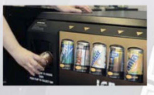
Chosen can is delivered at convenient height

The IceBreak by DarenthMJS is the perfect choice to partner with a hot drinks machine and provides a cost effective, highly convenient and reliable solution to all cold drink requirements. Incredibly simple to both refill and operate, all available products are displayed through crystal clear display "bubbles" to maximise brand impact and which the user simply pushes to have the chosen can delivered ice cold and at waist height.