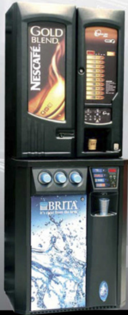
WaterBoy partnered with the Refresh 700

Optional Ultra Violet water purification system for enhanced water quality.