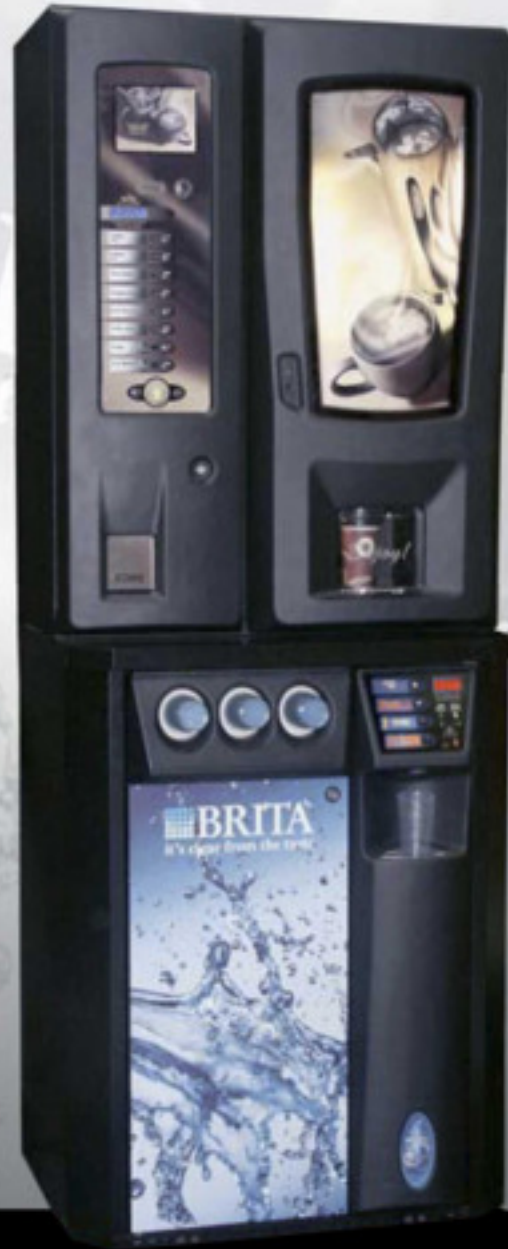
WaterBoy partnered with the Seville