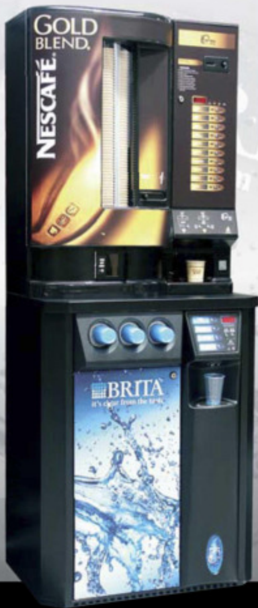
WaterBoy partnered with the 1066 Auto in Gold Blend livery